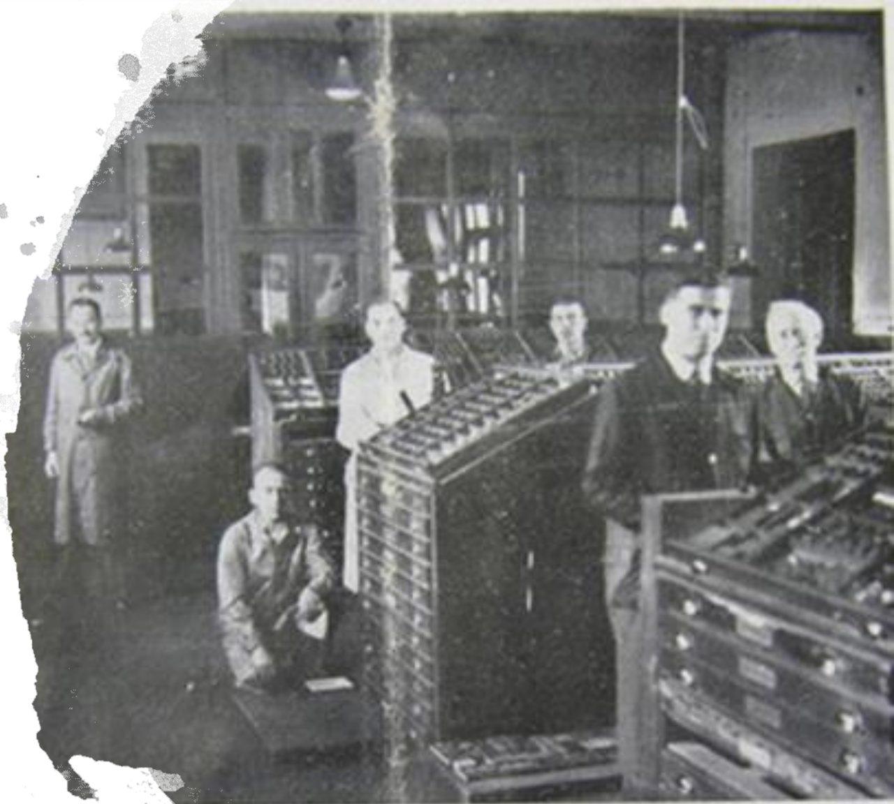
katermekből: Kisebb nyomtatványok részlet. „Linotype” szedőgép munk